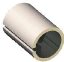
FLEX 100 & 125 Adapter Bushing Part #S.100.AA.140

If you are purchasing any of our Adapter Bushing, you might also want to look at: