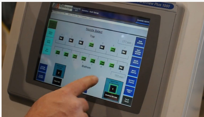
PLC based operator interface touch screen.