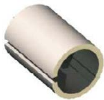
Flex 100 & 125 Adapter Bushing Part # S.100.AA.140