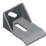
Part # S.125.AB.143