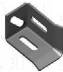
Part # S.125.AB.141