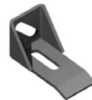
Part # S.125.AB.142